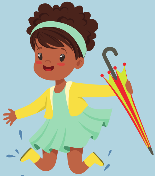
Jumping in puddles