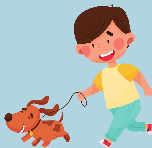
Walking the dog